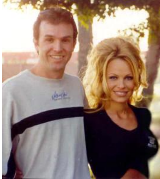
( Lee with Pamela Anderson on the V.I.P. set )